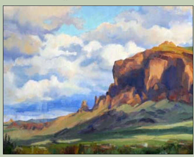
SUSAN VOLK STANLEY

VERY SUPERSTITIOUS Oil 16 x 20" www.susanvolkstanleystudioarts.com Studio: 480-767-7957